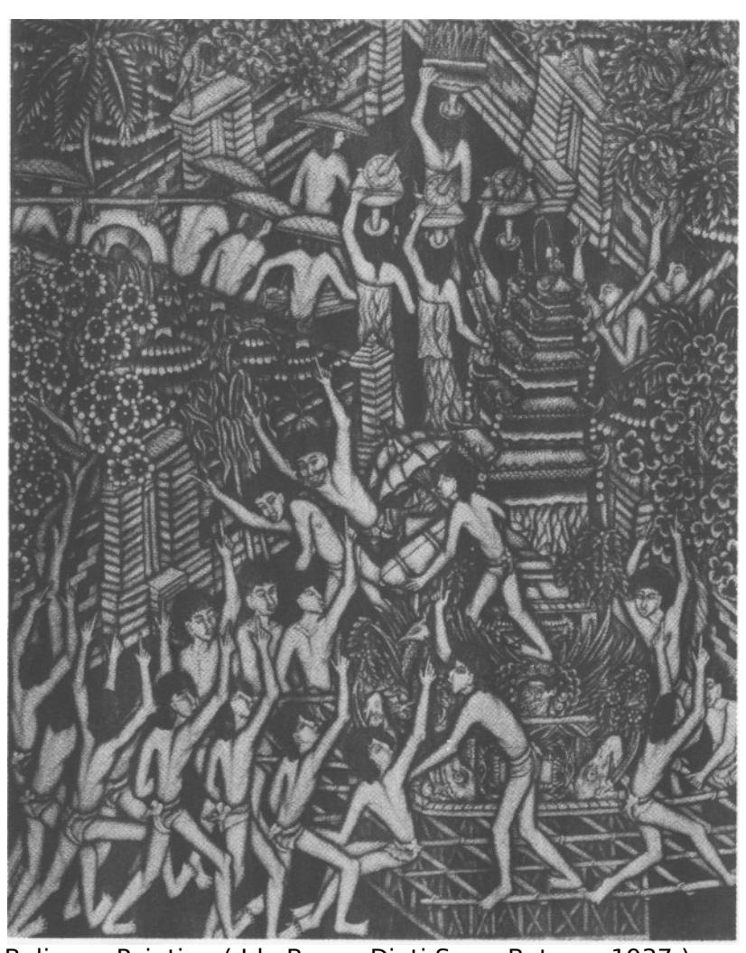
Balinese Painting ( Ida Bagus Djati Sura; Batuan, 1937 ) [Analysis, p. 147]